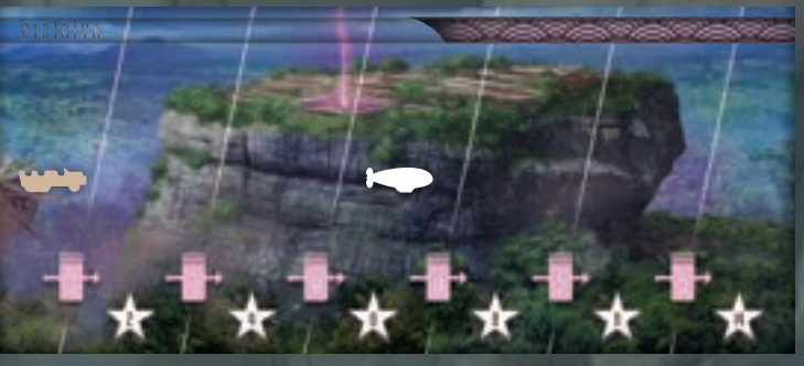
The Brown Half-Track player scores 8 points from sites: 2 in Machu Picchu, l in Chichén Itzá, 3 in Great Zimbabwe, 4 in Grotta Azzurra, -2 in Nan Madol, and 0 in Sigirîya.