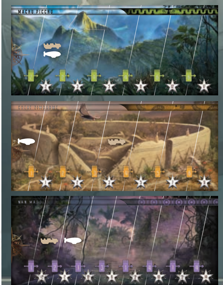
The White Zeppelin player scores 10 points from sites: 2 in Machu Picchu, 0 in Chichén Itzá, 0 in Great Zimbabwe, 0 in Grotta Azzurra, 2 in Nan Madol, and 6 in Sigiriya.